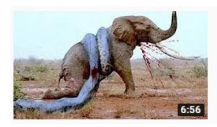
14 CRAZIEST Animal Fights Caught On Camera Jake's Top 10 • 6.6M views • 1 year ago

It should be made clear that terms such as "woman", "gay", "lesbian", "democrat" and "liberal" are likely negatively charged due to their use in political commentary that is often deemed to be non advertiser friendly. That is not to say that this doesn't have a negative impact on minorities and will lead to discriminatory demonetization of perfectly acceptable videos regardless of context. The classifiers that Youtube use are probabilistic and if certain words are overrepresented for manually confirmed demonetized videos then the demonetization classifiers will have an increasingly harder and harder time differentiating between what is and isn't acceptable. Resulting in more and more perfectly acceptable videos being demonetized and requiring manual review.