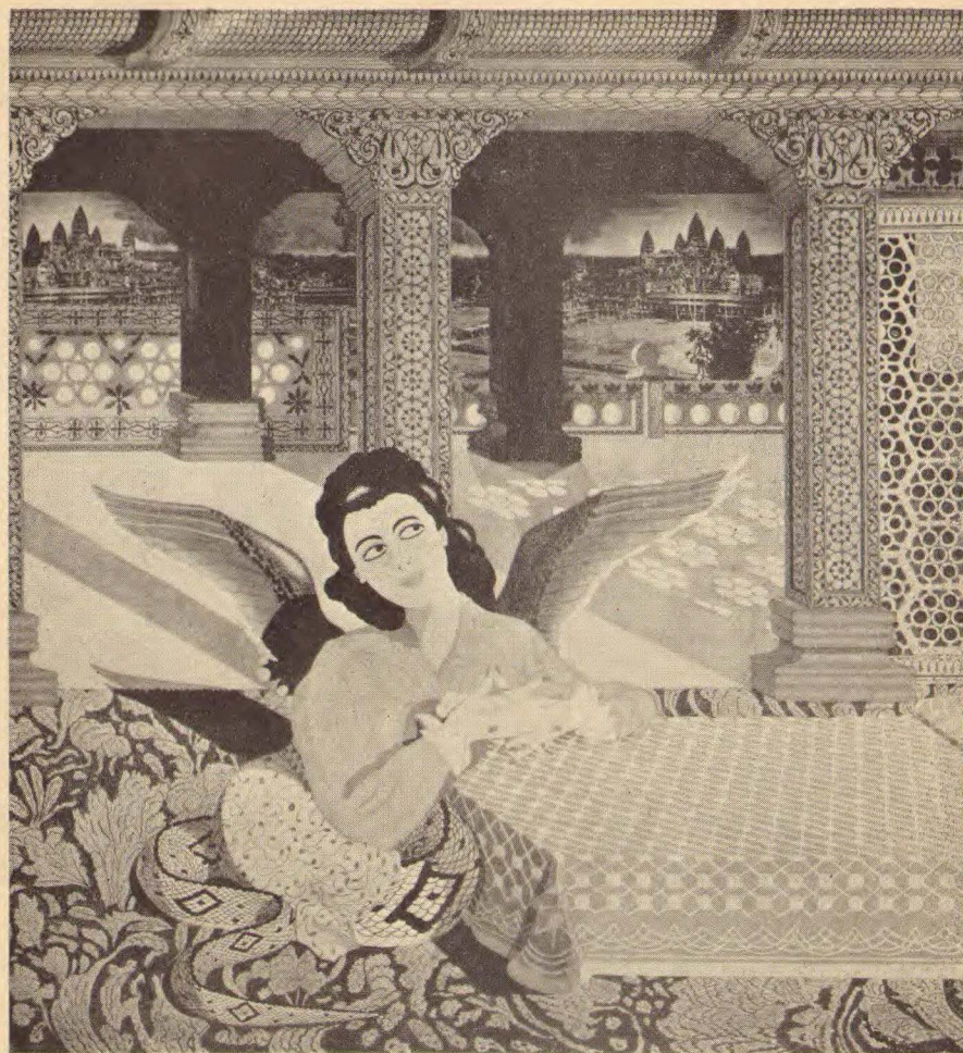
Kali, the Female of the Serpent System